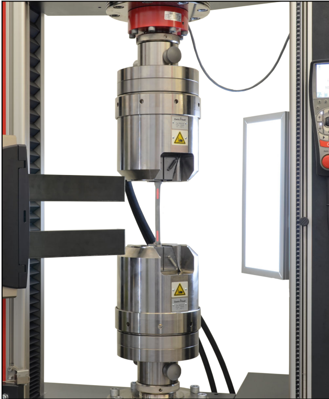
Hydraulic grips Type 8594, Fmax 100 kN, body over wedge